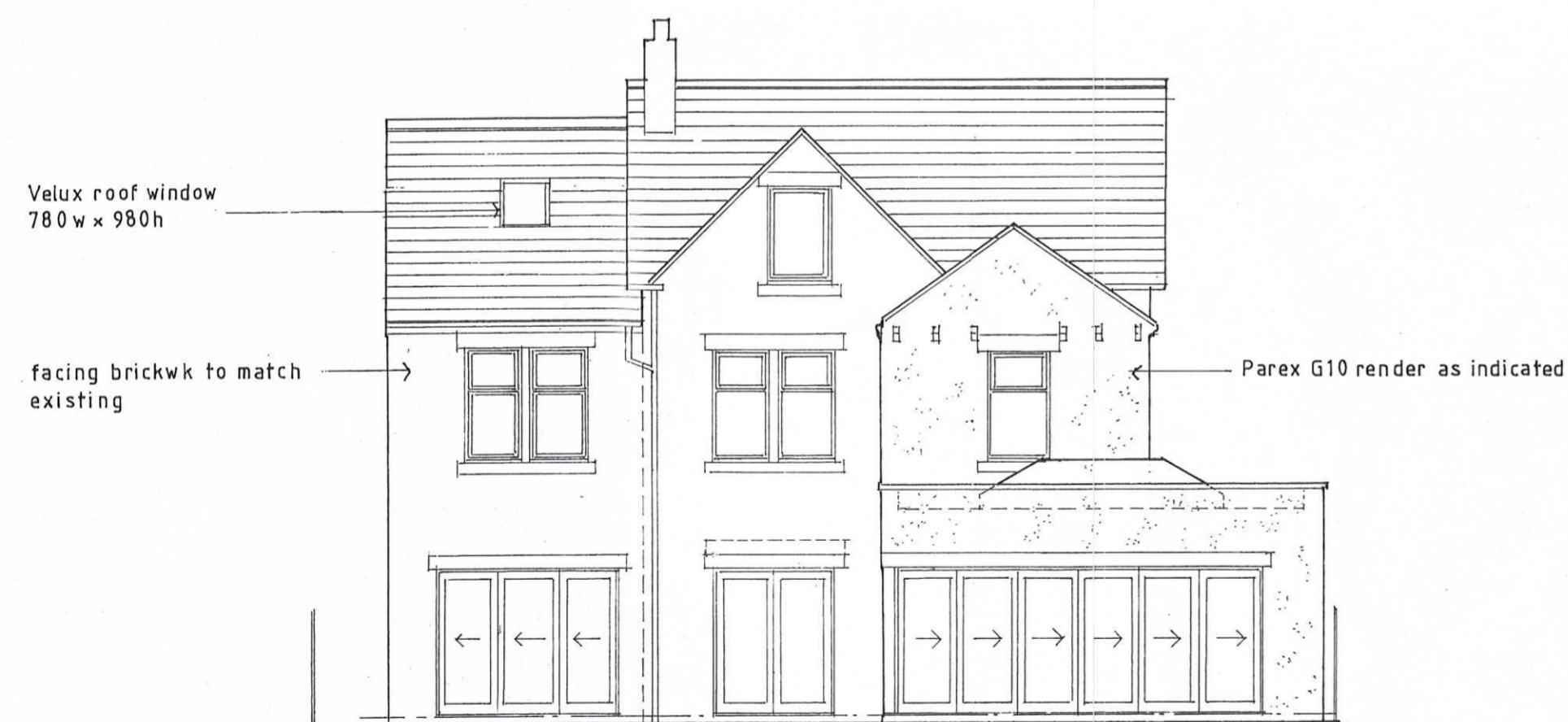
REAR ELEVATION - EAST