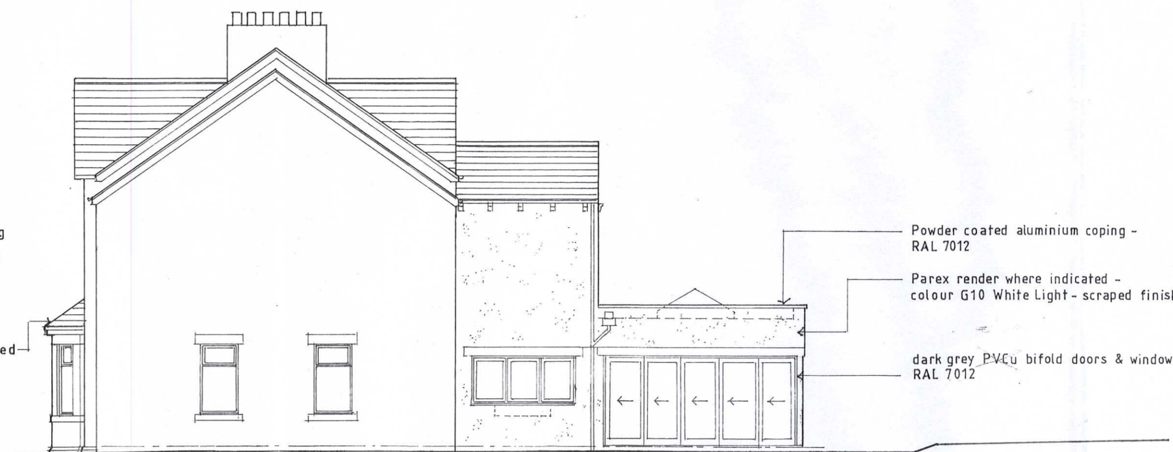
SIDE ELEVATION - SOUTH