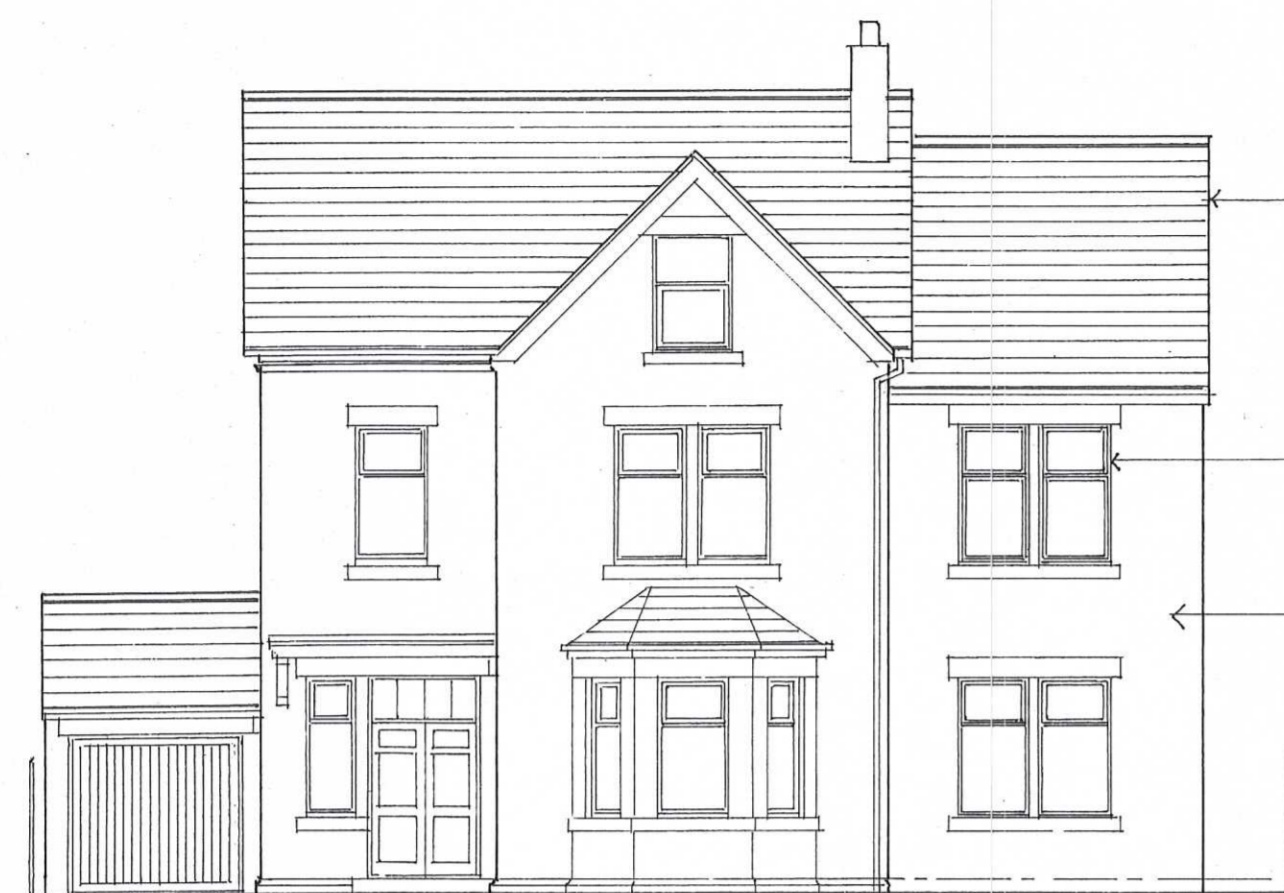
FRONT ELEVATION - WEST